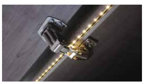
Overhead Cabinetry Construction – Strong yet light Euro-Ply construction, combined with heavy-duty hinges and automatic LED lighting, rival custom residential cabinetry!