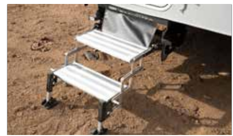
Glow Step Revolution Entry Steps - Provides sturdy, adjustable, glow-in-the-dark steps for safe and secure entrance and exit.