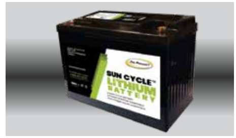
Lithium Batteries (1 or 2) are the latest battery technology offering more usable capacity vs. traditional batteries in a lighter, safer package.