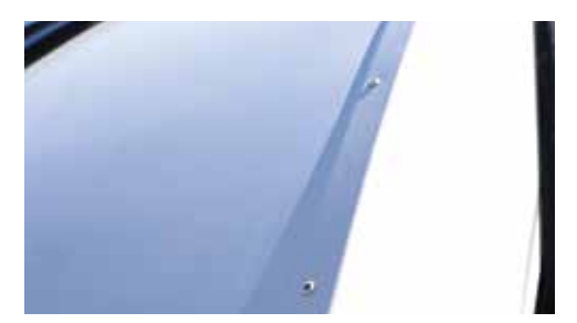
Keeping it all together are stainless steel fasteners. Unlike our competitors, this expensive hardware resists corrosion making for a lasting investment.

Since 1965, Lance Camper has been building the highest quality travel trailers and truck campers, designed to deliver the most value and enjoyment possible. For 2023, we have raised the bar yet again in quality, design, and value. As a result, those who have owned a Lance return again and again. For the first-time buyer, we encourage you to "purchase your last RV, first!"