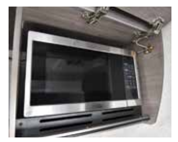
Flat Bottom Microwave - Offers the latest cooking technology.