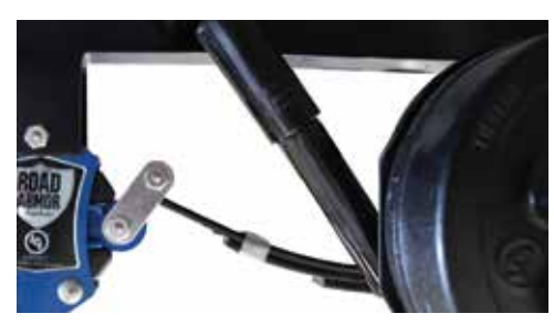
Shock Absorbers - Take your suspension to the next level by protecting your trailer against less than perfect roads and providing an even smoother ride. N/A 1475 & 1575