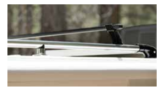
Lance Load Roof Rack - Safely store your canoe, kayak, paddle boards, etc. N/A 1475 & 1575 (Weight Limit 500lbs. Distributed)

It's a short list.....Our lengthy list of standard features, which most competitors call "optional," has no equals. The following additional features is a sample of what is available for those seeking the absolute pinnacle of luxury. Please see pages 16 & 17 for a complete listing of optional equipment.