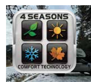
Four Season's Comfort Technology Package - Key features including a heated holding tank design, insulated hatch covers & insulated over-cab bed mat, keep you warmer in the winter and cooler in the summer!