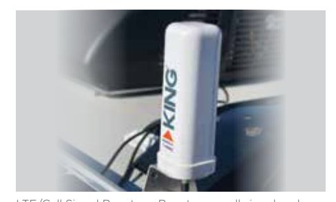
LTE/Cell Signal Booster - Boost your cell signal and reach more cell towers, while multiple users enjoy greater coverage and faster on-line speeds with no extra monthly fees.