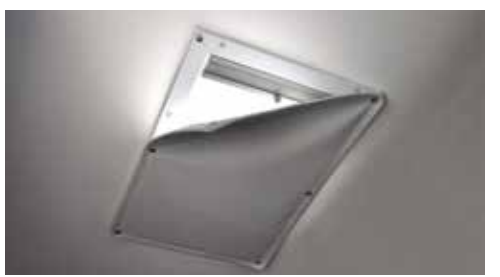
Hand sewn in our facility, the insulated hatch covers add an additional layer of insulation to vents and sky lights.