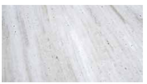
Solid Surface Counter Tops - Residential styled galley counter tops look beautiful while resisting the negative effects of moisture.