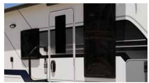
Ultra-Lightweight Dual-Pane Acrylic Euro Windows with built in screen and black-out shade, provide a stylish aesthetic with a wide range of adjustability as desired, from the secured vent only position to wide open for maximum airflow.