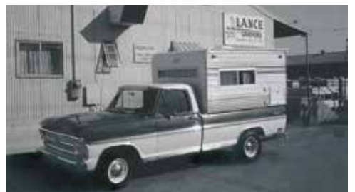
California Roots - From humble beginnings in North Hollywood, CA, in 1965 to our current home in Lancaster, CA, as a result of a fierce dedication towards building the highest quality RVs possible, understanding our customer's needs and insulated from the "me too" designs of our competitors, the Lance brand has become one of the most respected and sought-after brands in the industry.

Over 50 years of quality and industry-leading innovations have positioned the Lance brand as one of the most sought-after RVs on the road today. Respect is earned and not easily obtained in today's competitive marketplace.