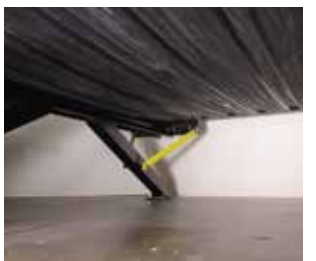
Electric Stabilizer Jacks W/Footpad - Make setup & teardown sweat free, keeping your trailer stabilized while parked. - N/A 1475 & 1575