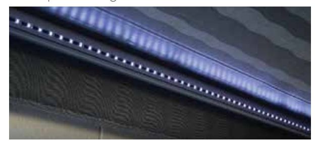
Latitude Powered Awning - Provides unobstructed shade with direct response wind sensor & LED light bar.

What other manufacturers call optional, along with Lance quality, our customers enjoy 20+ of the most requested features as standard equipment. Below is a sampling of the more popular options, please see pages 16 & 17 for a complete listing.