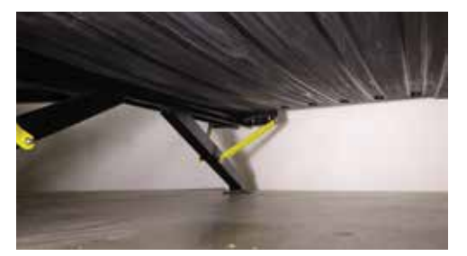
Heat is routed into individually insulated holding tanks to keep them, the valves and PEX lines warm.

Extending your camping season in comfort, Lance's Four Seasons Comfort Technology package is standard equipment on every Lance. The intentional selection of several vital features combines to ensure you and your loved ones stay comfortable as you explore during the "shoulder seasons"!