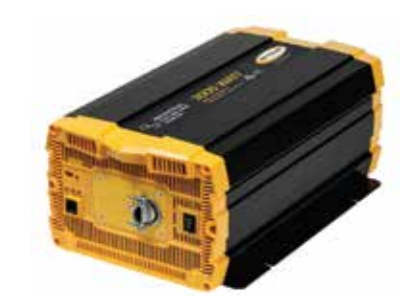
3000W Power Inverter converts battery power to 110V power allowing use of select appliances and devices including laptops, CPAP machines and others, while your away from shore power.